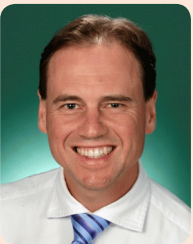
Hon Greg Hunt MP Minister for the Environment