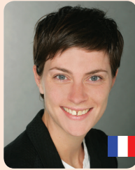
Julia Reinaud Institute for Industrial Productivity